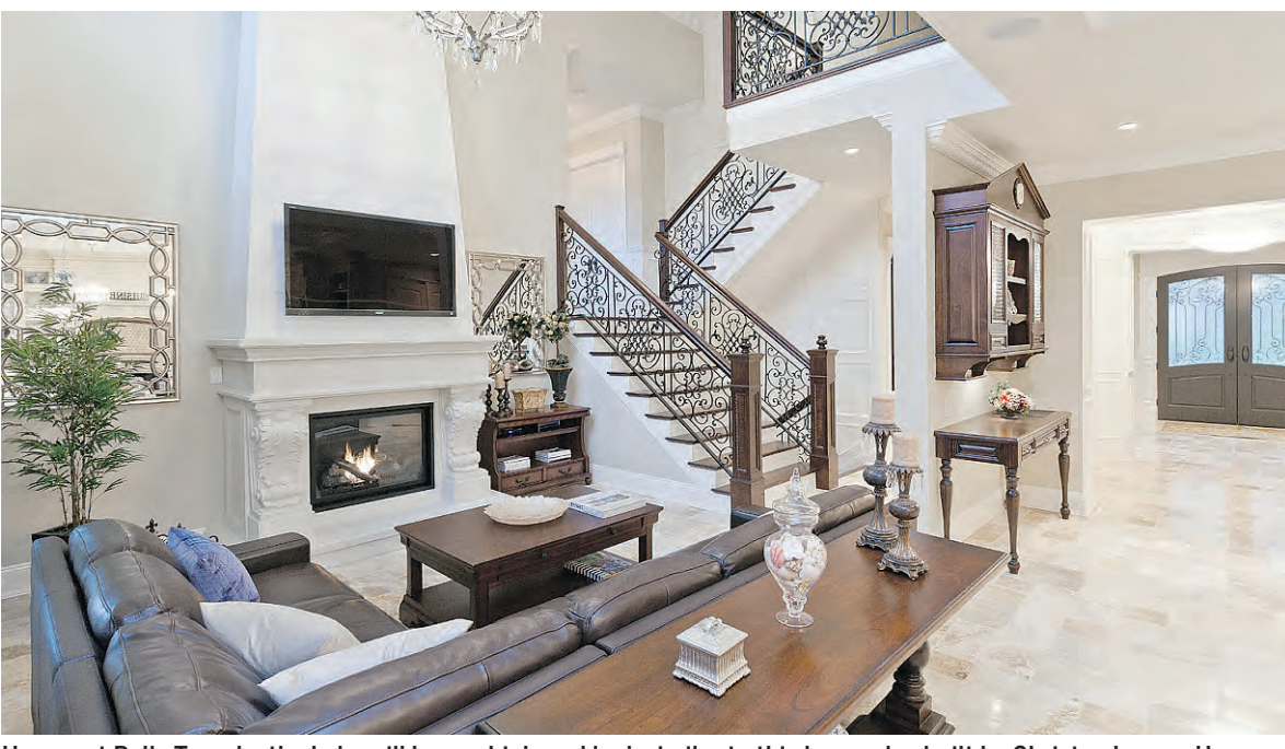
Homes at Bella Terra by the Lake will have a high-end look similar to this home also built by Christen Luxury Homes.

On the exterior of the Empress, buyers can have a stone veneer