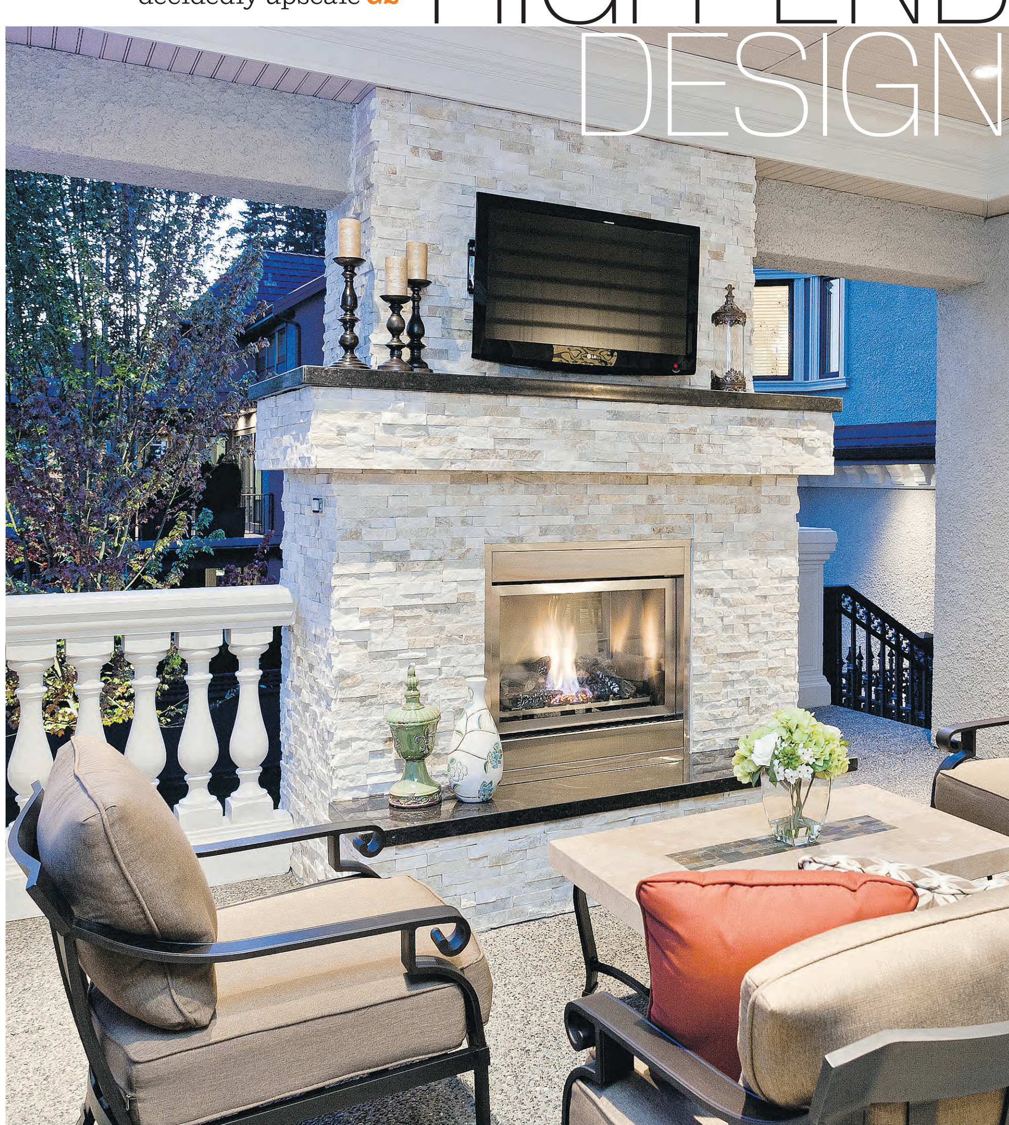
This home in Anmore is the work of builder Christen Luxury Homes, which is behind Bella Terra by the Lake, a 26-unit single-family home community, also in Anmore. Buyers are being offered eight upscale plans for homes ranging to more than 7,600 square feet.