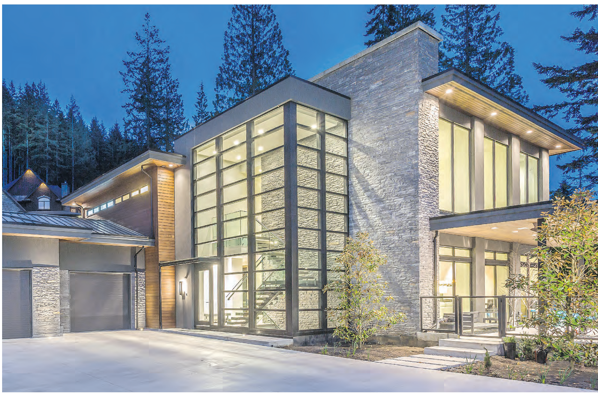
The eight upscale plans for homes at Bella Terra by the Lake are based on nearby homes, like this one built by Christen Luxury Homes.